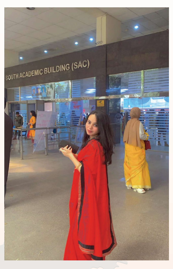
and songs. I have always been interested in exploring different cultures. My upbringing sparked my interest in exploring other cultures, leading me to appreciate diversity and global perspectives.